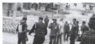
NSCDC confirms death of commandant in Nasarawa