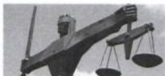
Two Kogi courts grant bail to 67 kidnap, armed robbery suspects