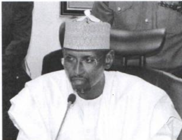
FCT Minister, Mohammed Bello