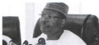
INEC registers 69,526 new voters in Niger